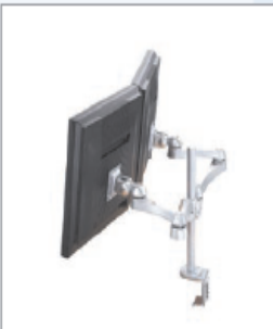
Dual LCD Arm EDS-307