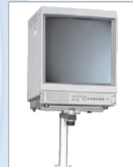
20" CRT Mount EDS-302

Monitor mounts are specially designed for use on EndoCart™ products or a supported wall.