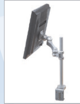
Extended LCD Arm EDS-305