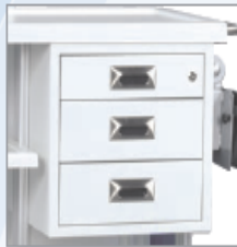
Three Drawer Box EDSB-203a