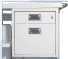
Two Drawer Box EDSB-203b