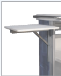
Side Shelf EDSB-204