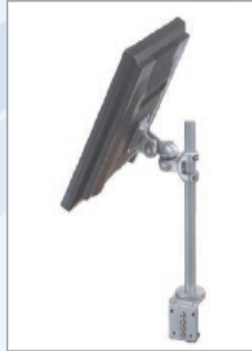
Standard LCD Arm EDS-304