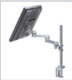
Articulating LCD Arm EDS-306